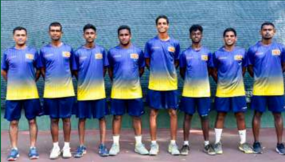
Team Sri Lanka

The much-anticipated Davis Cup, often hailed as the World Cup of international Men's tennis, has come to an end for Sri Lanka with mixed results and a heartbreaking defeat. Hosted by the Sri Lanka Tennis Association (SLTA), the Davis Cup was the grandest tennis event of the year, culminating with the finals scheduled for July 29. The matches were contested on the SLTA Clay Courts, providing Sri Lanka with a home advantage in this crucial tournament. Eight countries competed for the top three places, which would secure them a coveted spot in the Davis Cup World Group II starting next year.