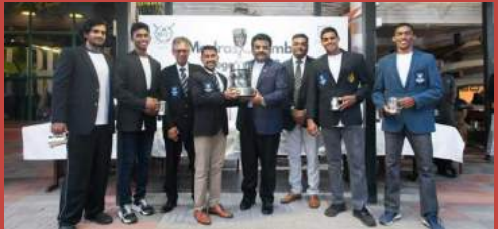
RESULTS OF THE MADRAS COLOMBO REGATTA 2023 @ CHENNAI - JULY 29, 2023