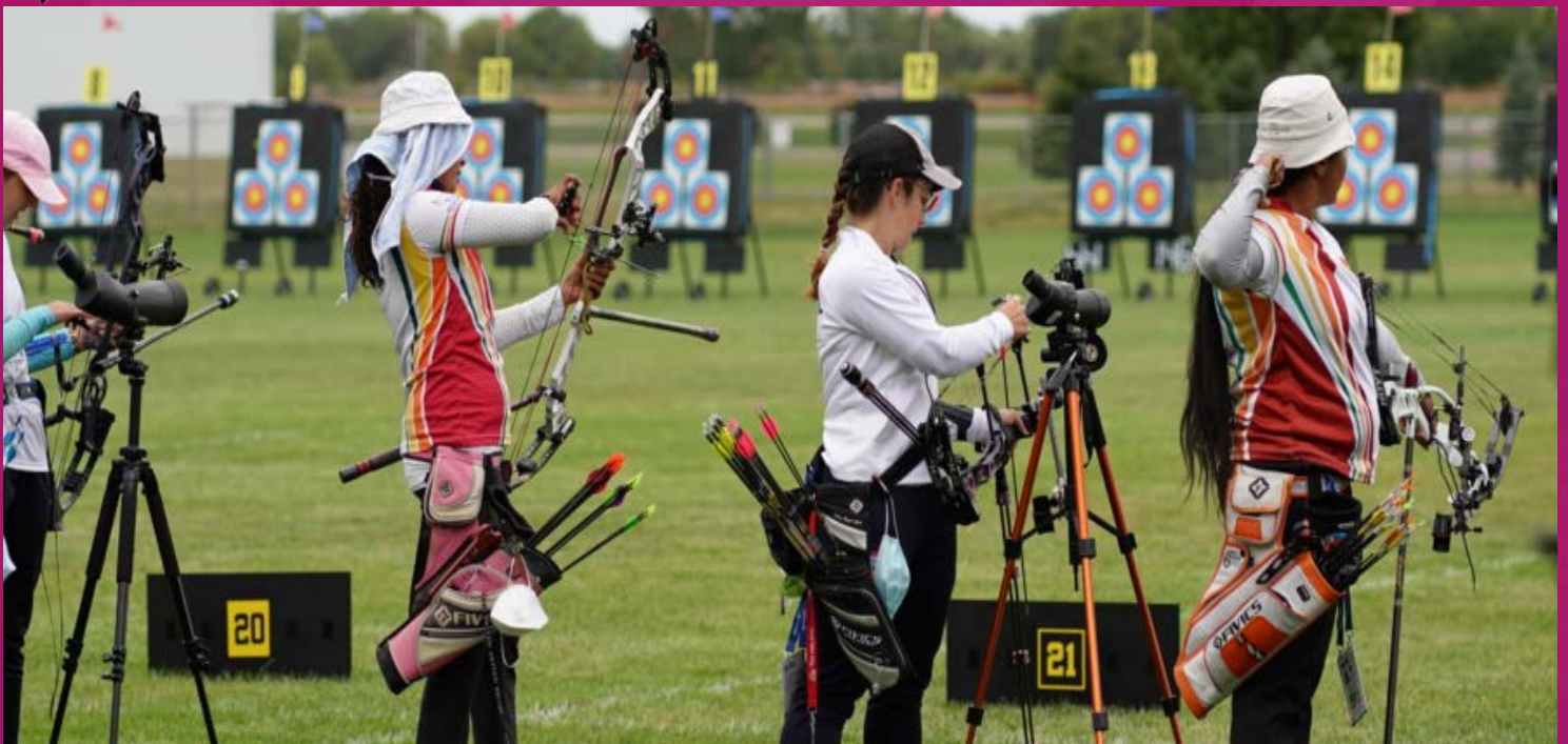
Lankan ladies in their competition