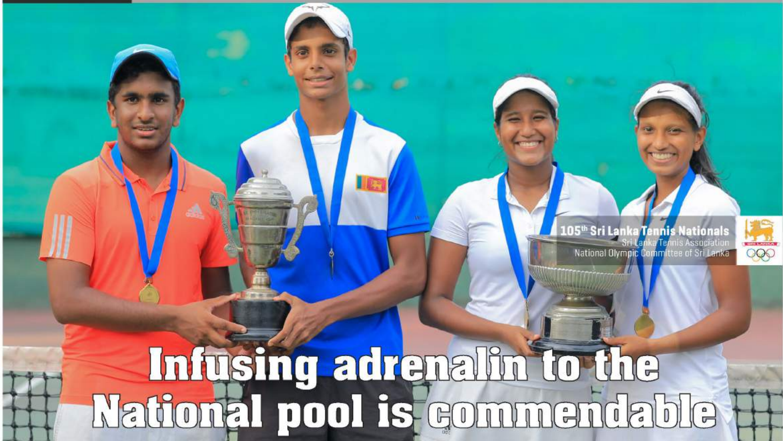
105 th Sri Lanka Tennis Nationals Sri Lanka Tennis Association National Olympic Committee of Sri Lanka

Tennis - a game not only for the rich and spoilt