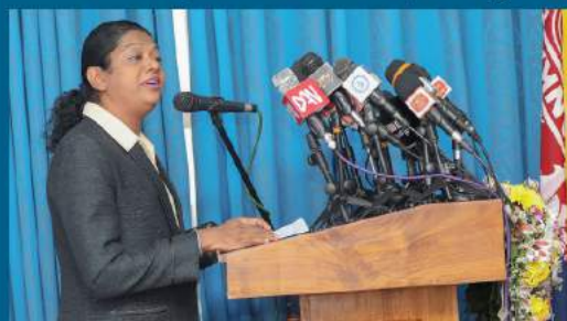
Olympic Medalist Susanthika Jayasinghe makes the keynote address