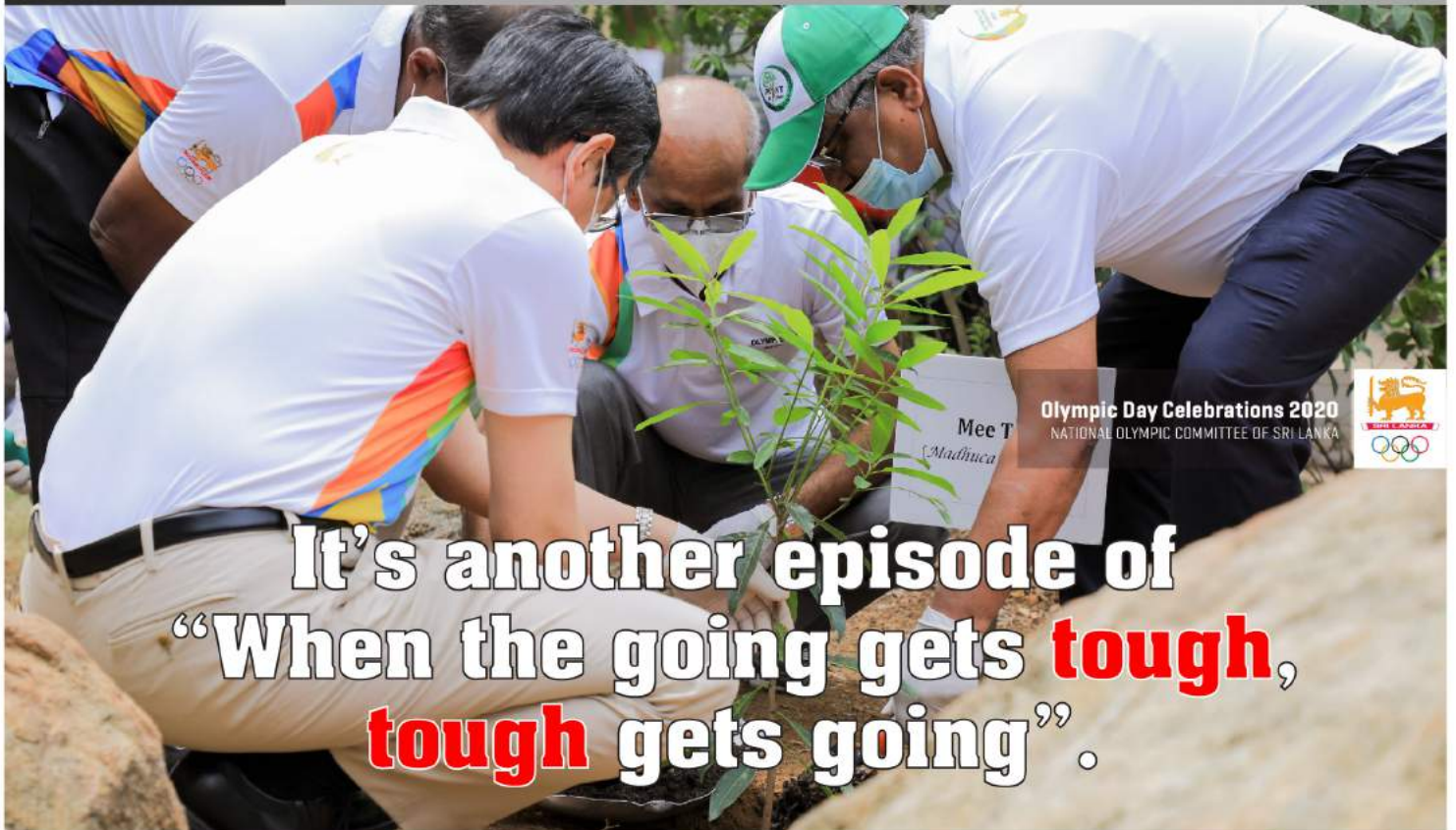
Olympic Day Celebrations 2020 NATIONAL OLYMPIC COMMITTEE OF SRI LANKA