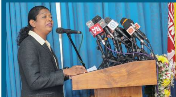
Olympic Medalist Susanthika Jayasinghe makes the keynote address