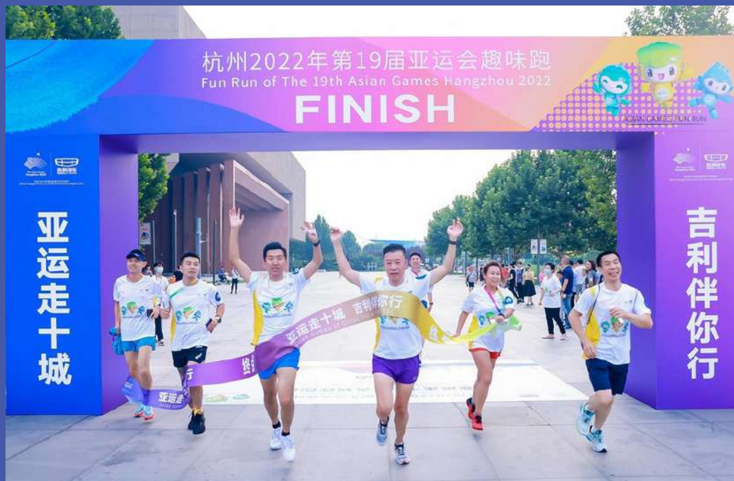
The Fun Run for Hangzhou 2022 in Shanghai

The OCA is working closely with the National Olympic Committees in all five zones to create a Fun Run calendar in order to promote the upcoming-