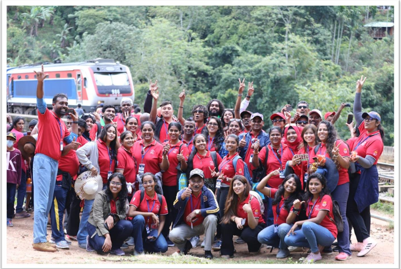
A picture taken during the field trip at the Nine Arch Bridges while a train passing through (4/12/2022)

base for the young to evolve embracing the 'Olympic Education culture' and grow concepts and enhance sport leaderships. And ultimately to be a contributor towards a peaceful region.