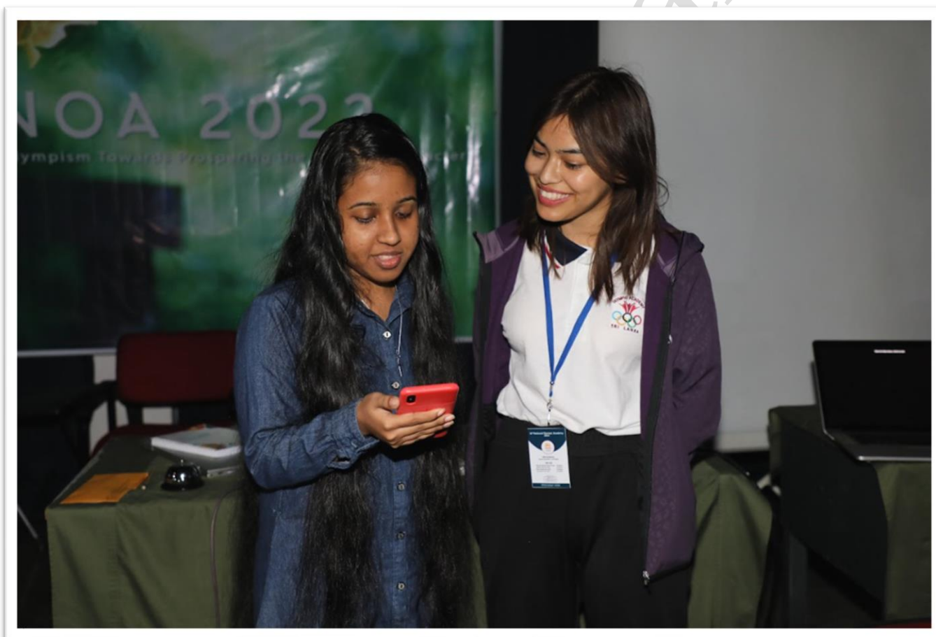
A Nepalese participant enjoying the session 3.5 with the young musician

The more information of the Day 2 can be followed through the NOC SL official YouTube channel and following the link herewith: https://youtu.be/hlBNq3P-5Bg .