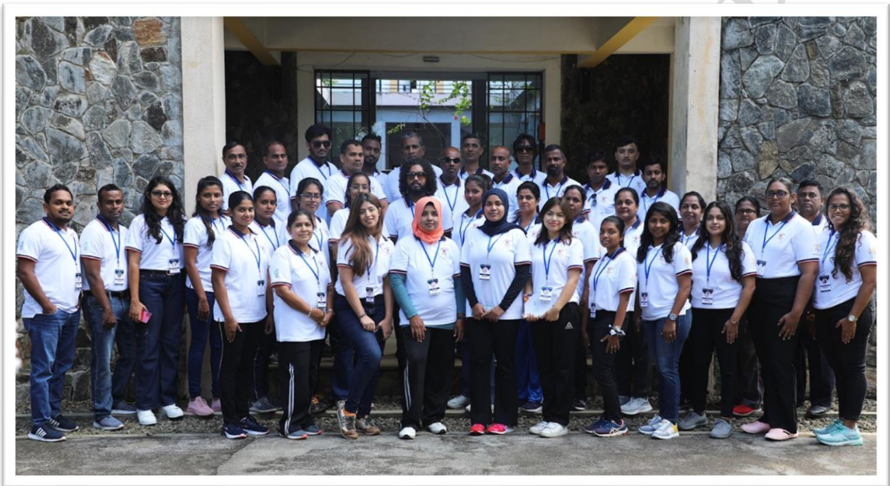
Participants of the NOA 2022 at the Main Entrance of the NHR Auditorium, Bandarawela

The main target group of the NOA 2022 was the primary school teachers through whom NOA SL expects to reach the strategic target of primary school children. This is a major milestone of the Olympic Movement in Sri Lanka through Olympic Education. Among the 30 participants twenty-three were Sri Lankan primary school teachers who comprised of twelve (n=12) female teachers and eleven (n=11) male teachers representing the public (n=19) and private (n=4) schools. The average age of the participants were age 30.9 years.